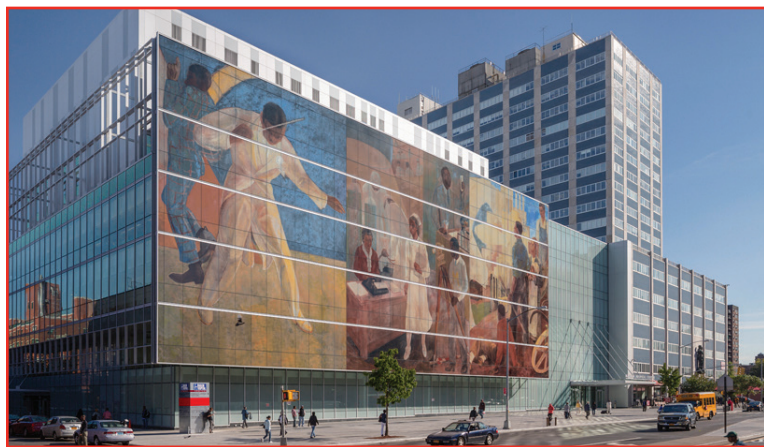
In 2013, Harlem Hospital Center completed a major modernization of its facilities. The 286-bed institution, a member of NYC Health + Hospitals, is the only hospital in Harlem providing healthcare to its diverse community of cultures.

The two institutions agreed to establish a permanent rotation of Columbia ophthalmology residents at HHC and to bring on a new Chief of Ophthalmology who, in addition to overseeing administrative functions, would develop mechanisms for community outreach, faculty and staff recruitment, and expansion of the resident educational program. The relationship increases the number of Columbia residents from nine to 12, with one resident from each year on site at HHC at all times, and significantly broadens the Columbia resident experience with exposure to a different hospital system and a broad variety of patients and ocular disease.