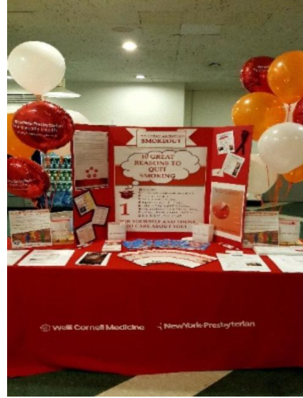
Tabling event for Tobacco Awareness month at NYP Weill Cornell.