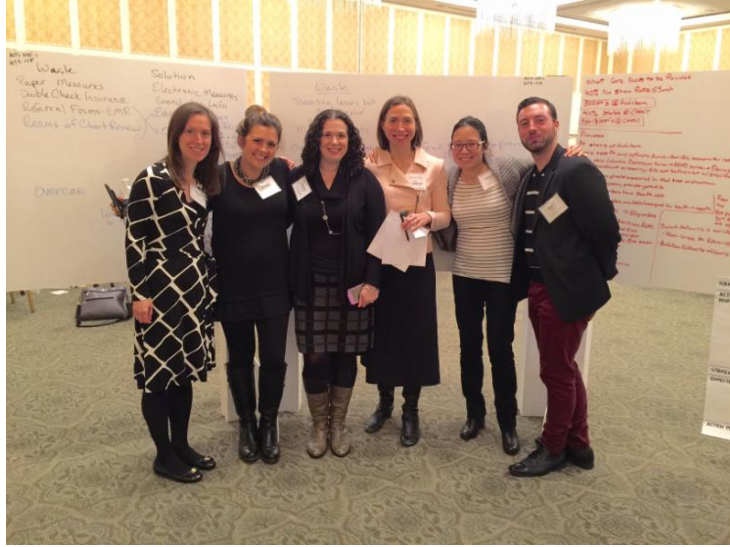
NYP PPS behavioral health project staff participating in the MAX series.

Health Project has been pleased to participate in the Medicaid Accelerated eXchange (MAX) Series Program this year, an 8-month intensive learning collaborative focused on continuous improvement and performance