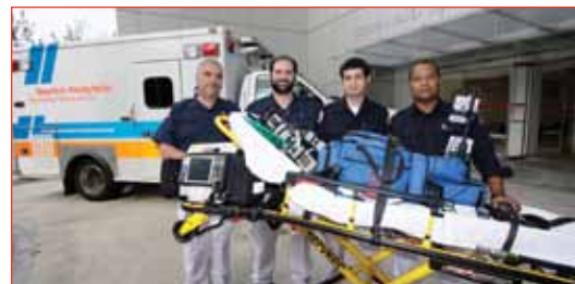
The Mobile ECMO Transport Team.

The second event was the 2009 influenza A (H1N1) pandemic, which led to cases of H1N1-associated ARDS. An observational multicenter study across Australia and New Zealand reported that the use of ECMO initially led to a 79% survival rate (54 of 68 patients) in patients with H1N1-associated severe ARDS. 2 A follow-up letter in March 2010 reported a 75% survival rate.