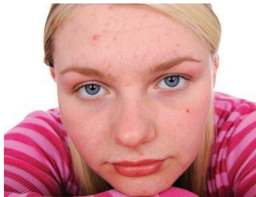
Increased acne is so common in the teenage years that it is not a reliable indicator of polycystic ovary syndrome.