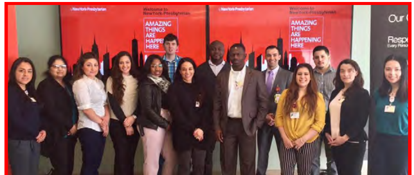
April 2019 New Hires