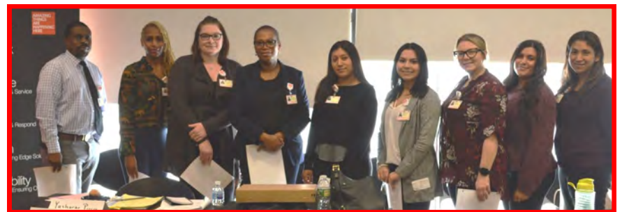
February 2019 New Hires