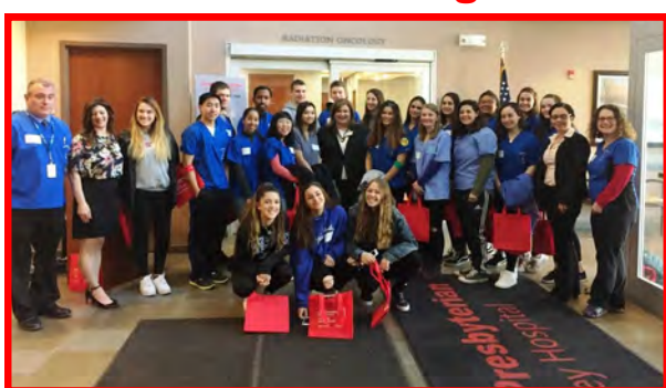
Hendrick Hudson High School Students.