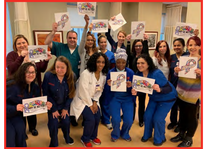
Cancer Center Team

To make an appointment with the Cancer Center, please call (914) 293-8400.