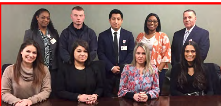
March 2019 New Hires