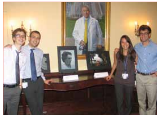
The LCCHM celebrates the premiere issue of the ASCENSUS WCMC Journal of Humanities .