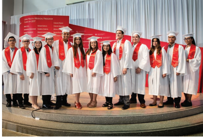
Lang Youth Graduating Class of 2017

To support our growing alumni community, our first Alumni Relations Coordinator is developing robust programming, including ongoing communication and networking forums, educational and professional development opportunities, and social events.