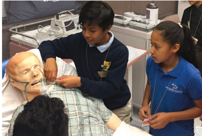
Students learn through hands-on simulations