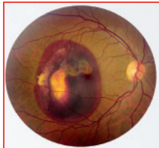
Wet age-related macular degeneration