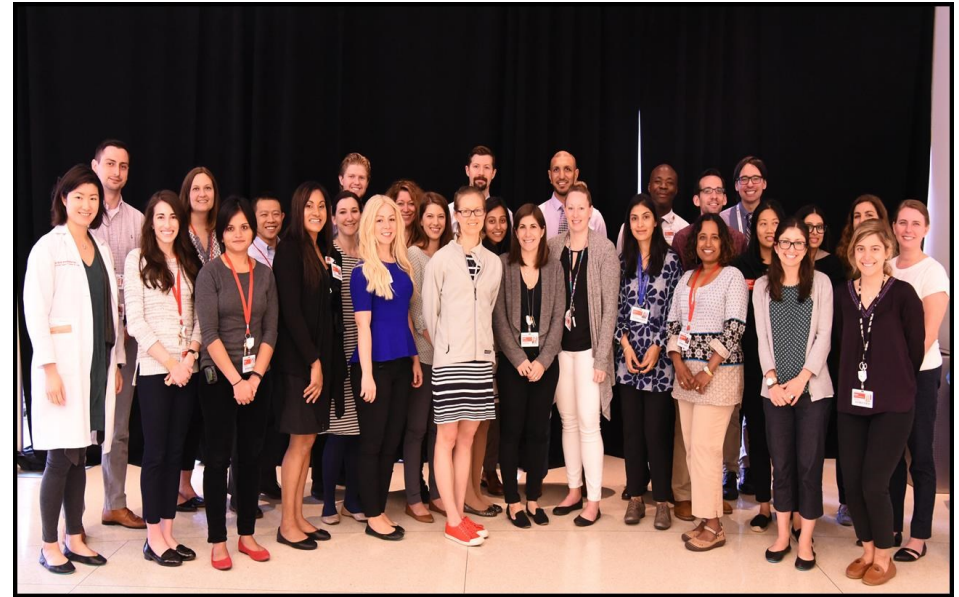
Columbia University Irving Medical Center Preceptors

We hope you are interested in joining our team!