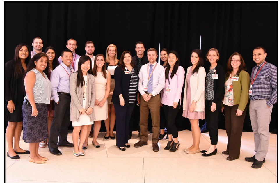
Weill Cornell Medical Center Preceptors