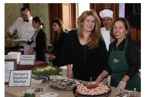
Dorian's Seafood Restaurant Team