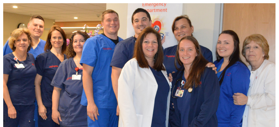
Emergency Department Structural Empowerment Unit