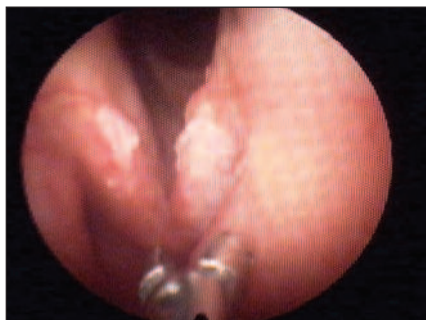
Stretching exercises can improve vocal fold healing

The disposable sheath also improves the range of treatment options. "There are certain cysts that can be decompressed with this technique by opening the cyst and then sending a suction catheter down through the sheath