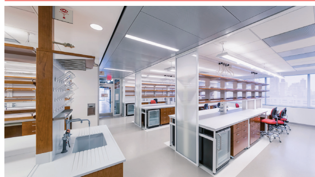
The new Belfer Research Building, which serves as the research hub for the Sandra and Edward Meyer Cancer Center, features 13 floors of laboratories equipped with the most advanced research technology.