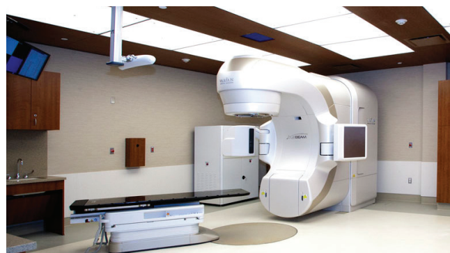
The new Irving Radiation Oncology Center provides leading-edge precision radiation therapies.

The new 12,500-square-foot Irving Radiation Oncology Center , part of the Herbert Irving Comprehensive Cancer Center, provides leading-edge precision radiation therapies for children and adults with cancer. The Center is equipped with the Siemens ARTISTE™, which allows for in-room real-time imaging that can see the tumor response and biological behavior as the patient is being treated, and the TrueBeam™ system from Varian Medical Systems, which offers high-precision image-guided radiotherapy and radiosurgery. The system is also now available at Weill Cornell.