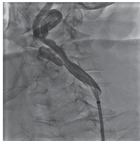
Image of a carotid stent: vascular specialists at NewYork-Presbyterian Hospital are seeking to develop patient selection criteria.

Approximately 2,500 patients have been enrolled nationwide, and the first results are expected in 2009-2010. The team is also enrolling patients in the ACT I (Asymptomatic Carotid Stenosis, Stenting Versus Endarterectomy Trial) that compares