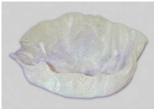
A synthetic bladder augmentation device could potentially help children with fibrotic bladders. This device is being assessed in preclinical studies.

Pediatric urologists currently use an approach called ileo-cystoplasty to treat these children, inserting a piece of the ileum to open and enlarge the bladder. But this surgery is extremely complex, is associated with a lengthy hospital stay, and requires a large incision. Moreover, there is a risk of complications such as adhesions and reactions to the ileal tissue. Ileal cells inside the