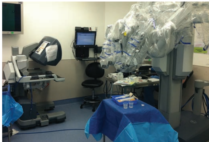
NYP/Morgan Stanley Children's is home to the busiest pediatric urologic robotics service in the New York metropolitan area.

The pediatric robotic surgery program is part of NYP/Morgan Stanley Children's multidisciplinary approach to patient care. Any other specialists a child may need — such as orthopedists, neurosurgeons, gastroenterologists, nephrologists, pediatric gynecologists, and radiologists — are all located at the hospital. Key to optimal patient care is an accurate diagnosis; a diagnostic center for children with complex urologic disorders is therefore a