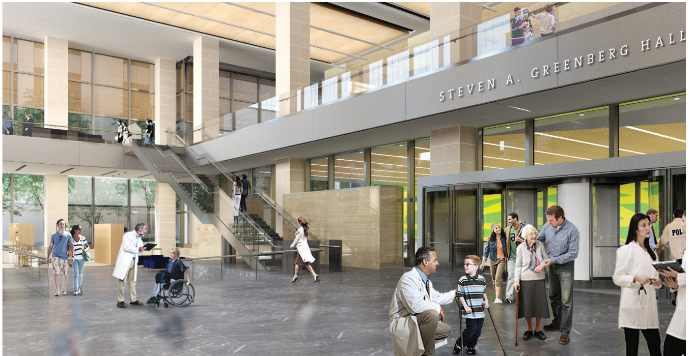
Rendering of the Steven A. Greenberg Hall, the lobby and mezzanine of the NewYork-Presbyterian David H. Koch Center.

The NewYork-Presbyterian David H. Koch Center, located on York Avenue between 68th and 69th Streets, is scheduled to open in the spring of 2018. It will be one of the most innovative and exciting hospital buildings to be constructed this century and a destination of choice for more than 150,000 patients annually.